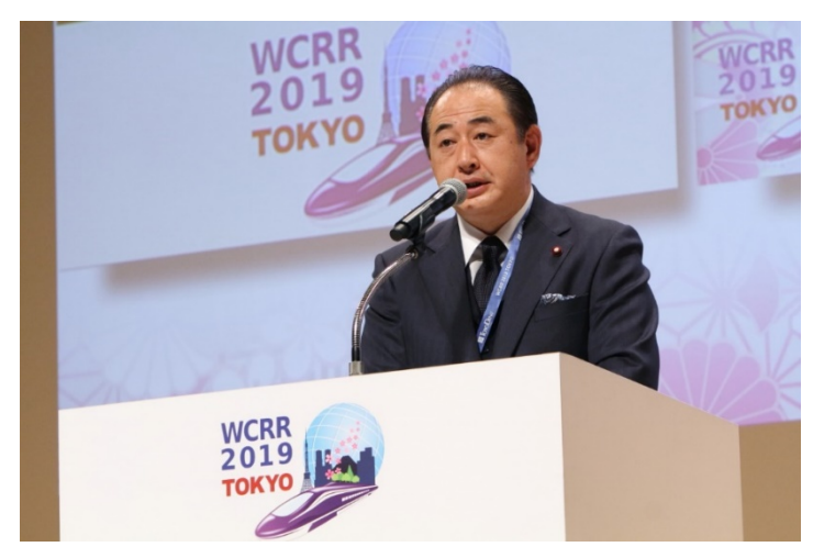
State Minister of Land, Infrastructure, Transport and Tourism, Mr. Nobuhide Minorikawa at the opening ceremony