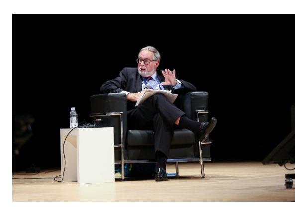
Emeritus Prof. Roderick Smith of Imperial College London moderating the Plenary Session 3