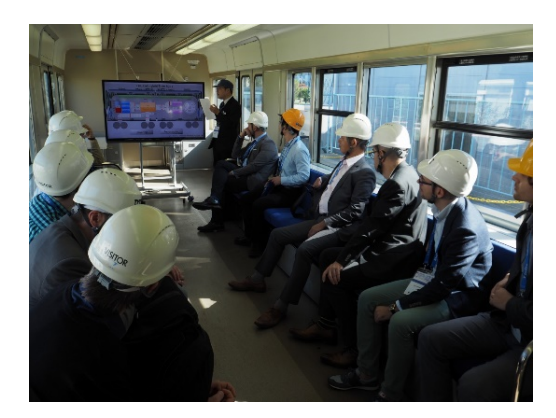
Participants on board the fuel cell hybrid powered test vehicle at RTRI