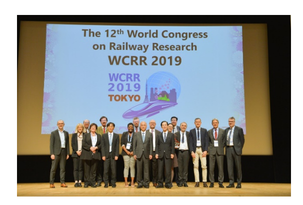
WCRR2019 Organizing and Executive Committee members