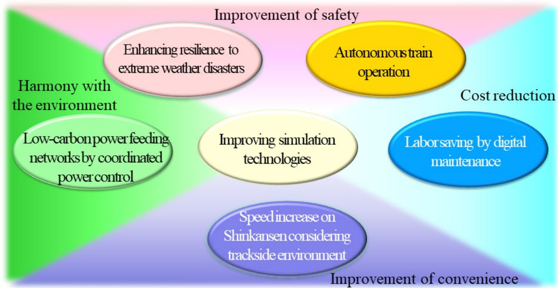
Research and development toward the future of railways