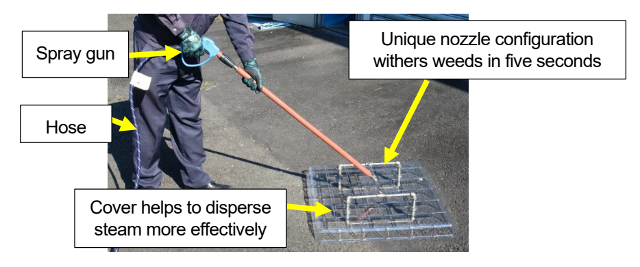
Fig. 2 Configuration of newly invented handheld nozzles

A general-purpose steam cleaner is adopted for this equipment. Consumption of water are reduced to 72 liter per hour (two nozzles are simultaneously used), less than one-tenth of that used for previous examples in agricultural fields. A cover portion is installed where steam heat is provided to weeds. The cover portion has a structure which retains steam inside. By operating the handheld nozzles (Fig. 2), the steam is sent to the cover portion.