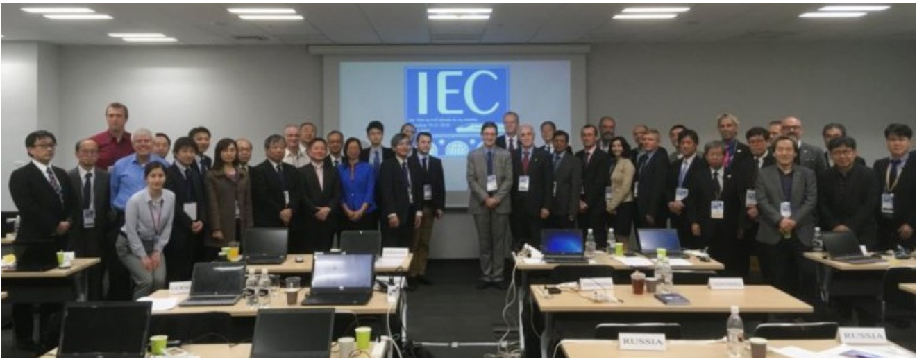
Participants of the IEC/TC9 58th Plenary Meeting