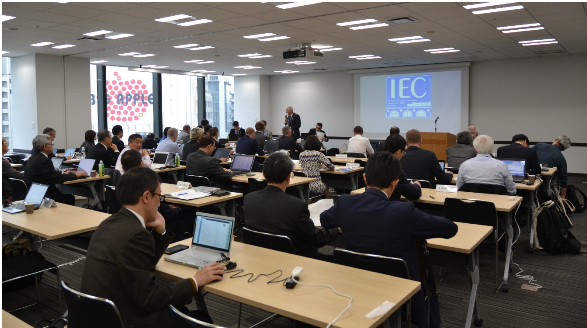
IEC/TC9 58th Plenary Meeting