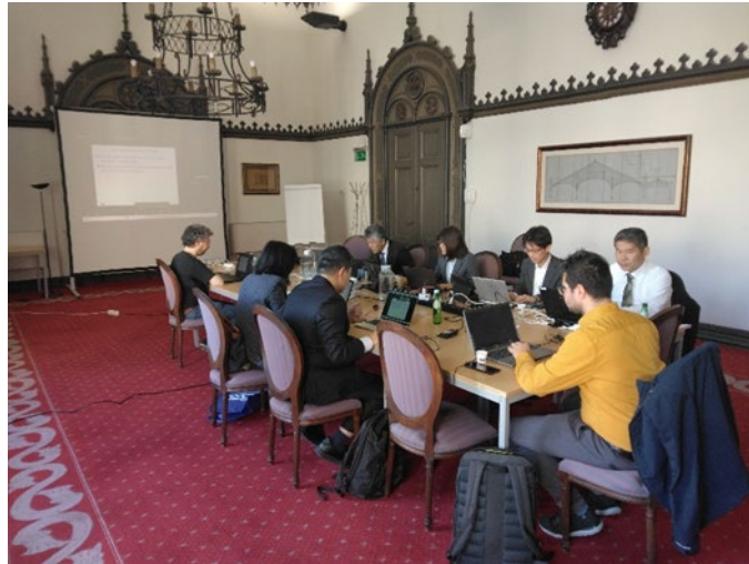
Figure 2 Deliberations at an international meeting

(4) April 15, 2026 ISO issued ISO 24675-2:2026 “Railway applications—Running time calculation for timetabling—Part 2: Distance-speed diagrams and speed curves.”