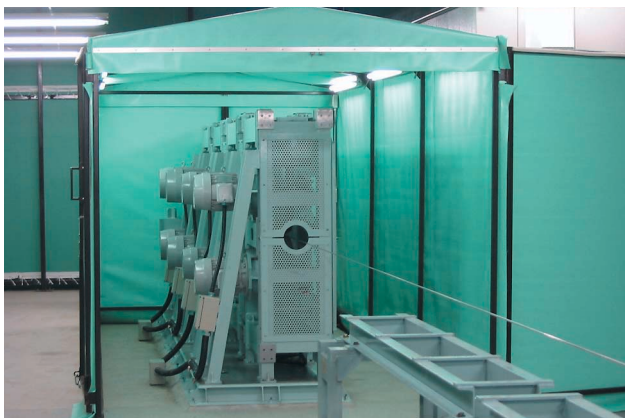
Figure 2. Launching device