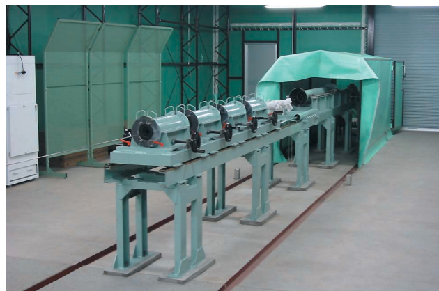
Figure 3. Brake device