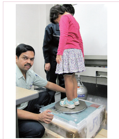
Fig. 4. Levitation of child using a repulsive force between home made batch processed LRE-123 pellets and home made permanent magnet disk