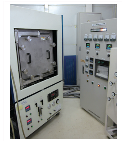
Fig. 1. Furnace designed for batch production of LRE-123